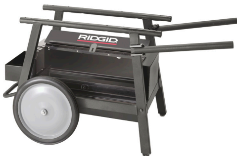
No. 200A with Steel Cabinet