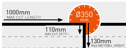
MAX CUT DEPTH - CST 100