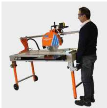
EASY TRANSPORT THANKS TO FOLDING LEGS AND WHEELS