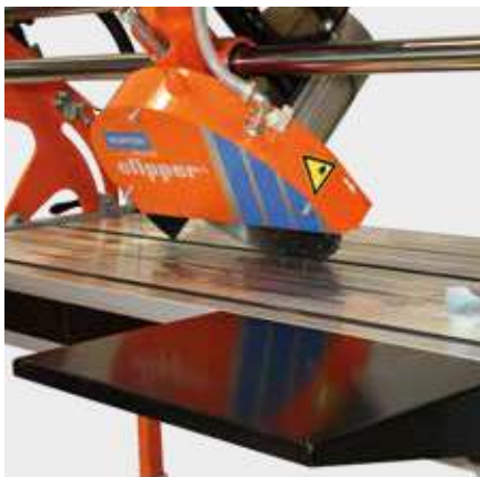
SIDE EXTENSION AND CUTTING GUIDE INCLUDED (450x300mm)